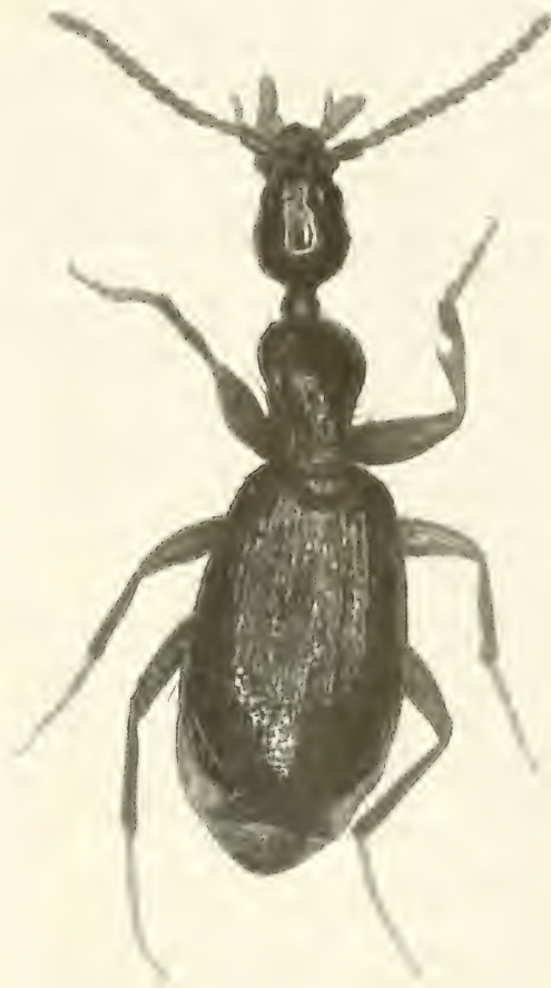
Fig. 4. Gunvorita bihamata , spec. nov. Habitus. Length: 5 mm.

cised, basal angles slightly projecting, obtuse. Lateral margin rather inconspicuous, without distinct border line, marginal channel absent. Median line fine, not impressed. Prebasal grooves almost invisible. Anterior marginal seta elongate, situated at anterior third of pronotum, posterior marginal seta shorter, situated right on basal angle. Surface without microreticulation, glossy, with moderately sparse, coarse puncturation. Distance between punctures c. 2\times as wide as diameter of punctures.